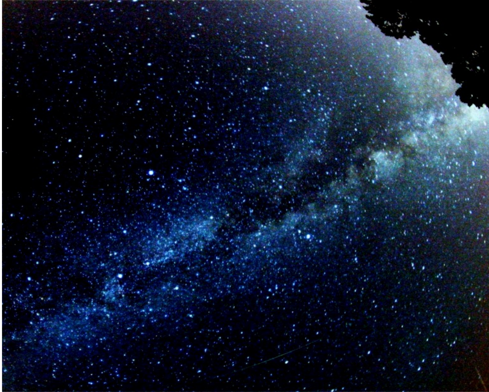
The Milky Way, time lapse photography with 13 minutes exposure

“...[A] Jewish myth [is] that in his mother’s womb man knows the universe and forgets it at birth.” Martin Buber